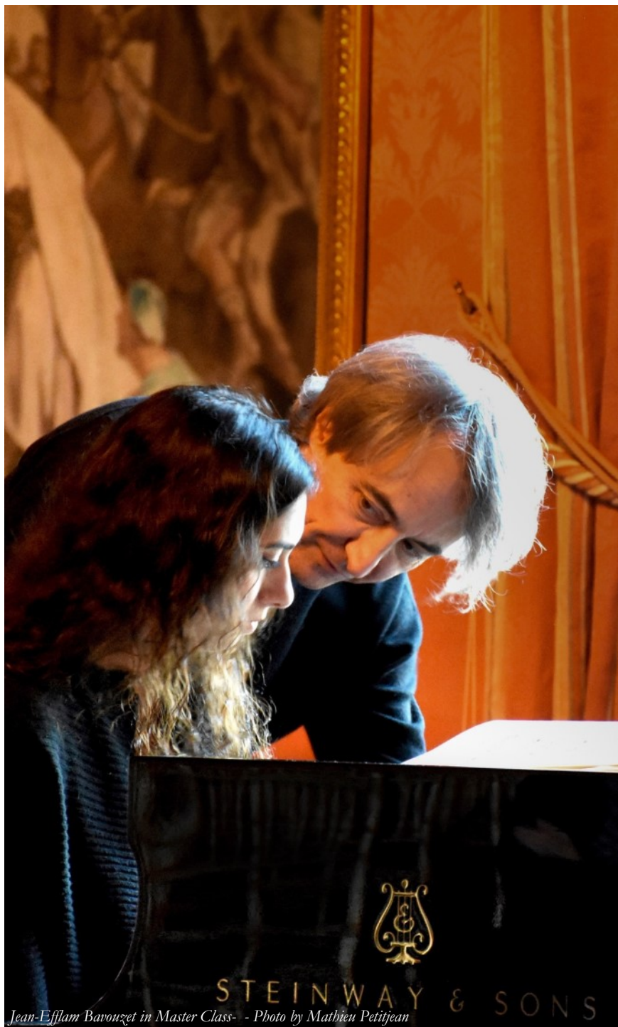
Jean-Efflam Bavouzet in Master Class - - Photo by Mathieu Petitjean